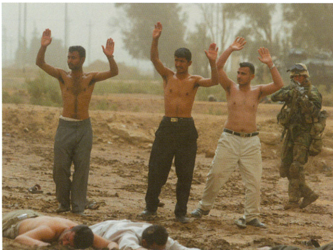
Marines guard Iraqi prisoners of war in Nasiriyah on 26 March 2003.

Probably the company that had the most difficult time over these next few days was Company C. The company was shorthanded due to the loss of 7 tracks, 18 dead, and 14 wounded on 23 March. In addition to the psychological impact of these losses, many Marines had had their personal gear lost or destroyed due to the destruction of the tracks. Some were worried about facing a possible chemical attack when they no longer had protective masks. Still, the company held together and continued to perform well, and Marines shared their gear and equipment with their comrades. 109